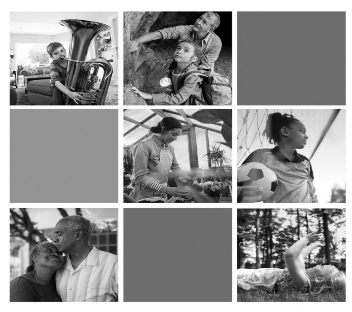
Your Health Care Benefits Program

A Division of Health Care Service Corporation, a Mutual Legal Reserve Company